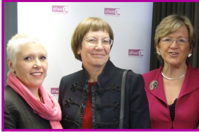
The Launch Event 31 March 2007 Leeds