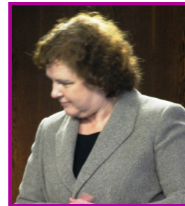
Engaging Women in Public Life 11 September 2007 Leeds